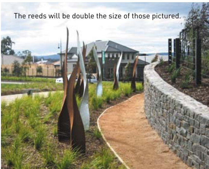
The reeds will be double the size of those pictured.

Also new to Central Walk will be "The Reeds". This public art consists of 10, 6m high stainless steel reeds forming an 'S' shape within the Woodville Street wetlands. These striking vertical structures will be very visible and will compliment the other 'hard' landscape works such as the pavilion, pedestrian bridge and viewing platform. I think we have already told you about the 34,000 native plants which will line the waterway but just in case you forgot – that's a lots of plants!!