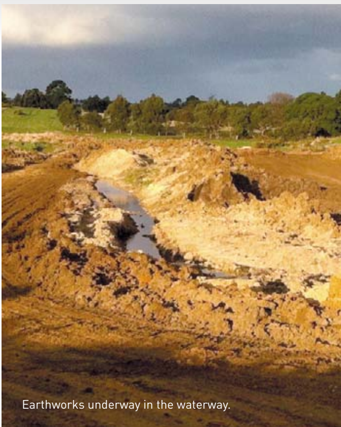
Earthworks underway in the waterway.

The program of works will now see titles issue in December 2012. We apologise to those who are impacted by this delay but hope you will understand that the wet conditions are circumstances beyond our control.